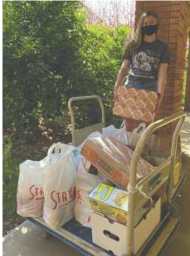
Glendora High School delivering food donations to Hope Partners.