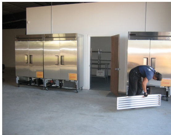
Sova refrigerator and freezer's being assembled