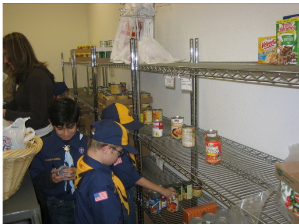
The Boy Scouts of America stocking the shelves at Sova