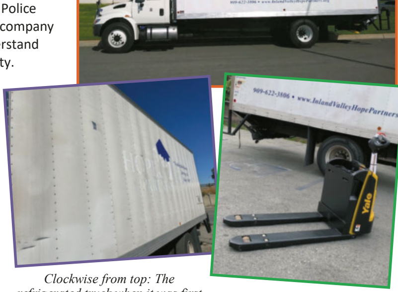
refrigerated truck when it was first purchased six years ago; the recently donated electric pallet jack that was taken from the truck; and the side of the truck revealing the thieves' attempt to completely remove our logo wrap from the vehicle.

Imagine our surprise when, just before Halloween, we received a call letting us know our truck had been recovered by Palm Springs PD! The truck had been abandoned and although there was some visible