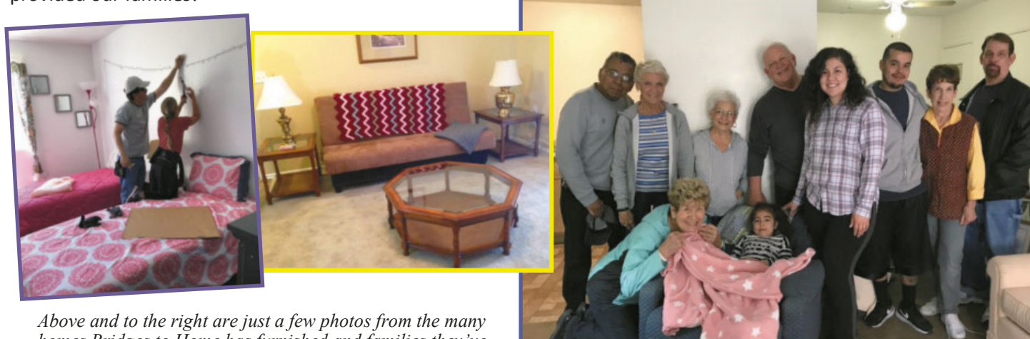
Above and to the right are just a few photos from the many homes Bridges to Home has furnished and families they've assisted during their decade of service to the community.