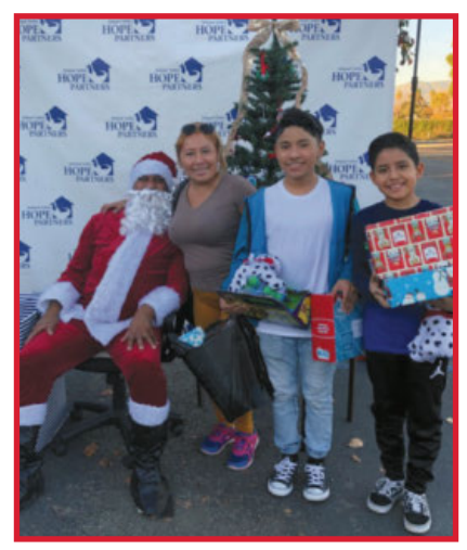
Even Santa joined in the fun at a previous holiday event at our Beta Program Center in Pomona.

Holiday Food Items: canned vegetables (corn, peas, carrots, yams, green beans,